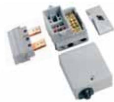
House Service Cut-outs