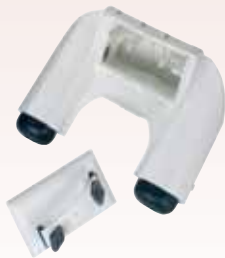
Pole Mounted Cut-Outs