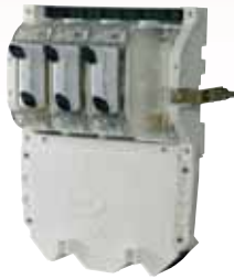
Heavy Duty Cut-outs